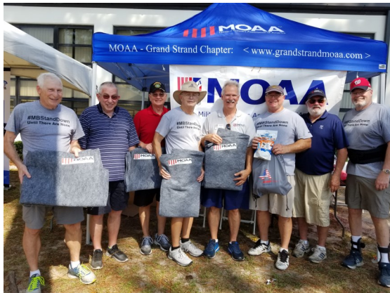
Grand Strand Chapter volunteers, at left, distributed blankets and warm-up kits to veterans at Stand Down. Numerous Chapter volunteers devoted time to support this event.