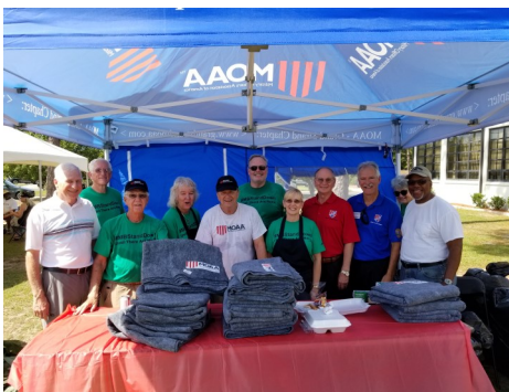
This picture taken at Stand Down 2018 will be used in raising funds for the MOAA Foundation.

National MOAA's recognition of our Chapter's work on behalf of veterans and military personnel is a testament to our strong commitment to assist those who serve and who have served our country in uniform. Congratulations to all members who have been a part of these efforts in any way.