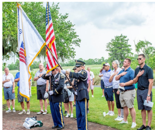
SC State Guard provided the color guard