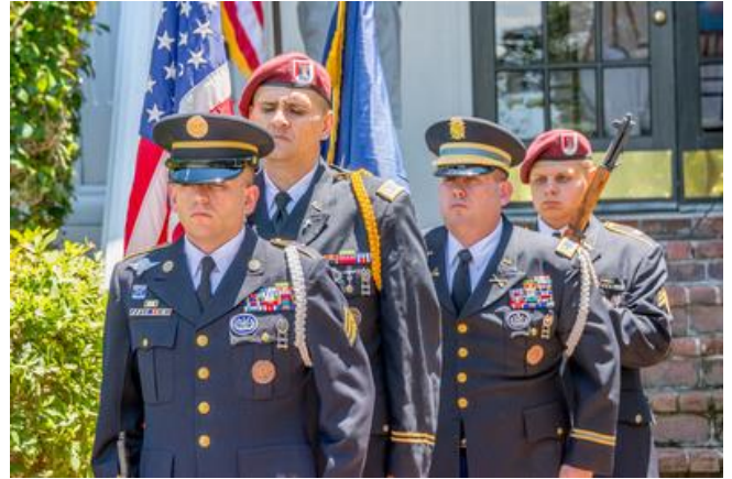
The South Carolina State Guard Honor Guard prepares to officially start the tournament