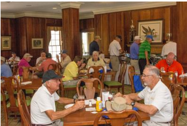
Golfers get a meal before hitting the links