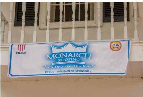
The tournament's major sponsor Monarch Roofing displayed its sponsorship banner.