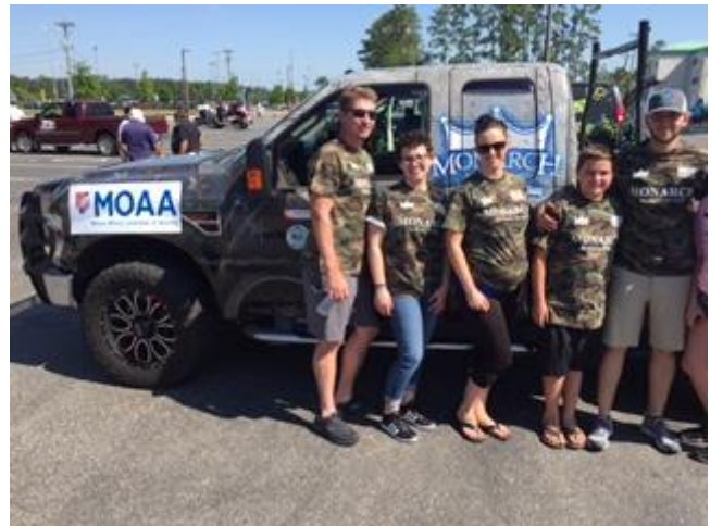
A Monarch roofing crew prepares for the Military Appreciation Days parade