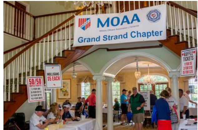
The Heritage Club in Pawley's Island was abuzz with activity on May 25 for the Grand Strand Chapter's fourth annual golf tournament.

enable us to respond to the emergency needs of low income veterans, such as veterans displaced following Hurricane Matthew and the 2015 floods, as well as supporting other organizations assisting veterans in our area.