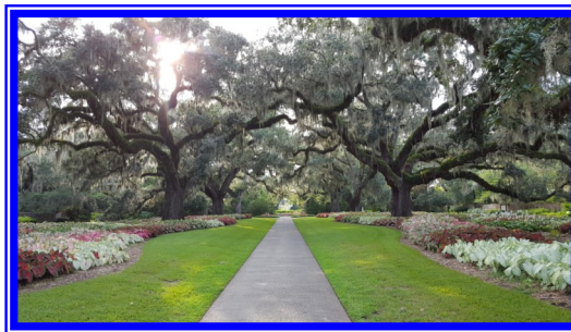
Brookgreen Gardens, Murrells Inlet, SC

Enjoy your Thanksgiving, wherever that may be, and with whomever you are with. Count your many blessings for they are many.