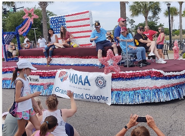
Thanks, again, to Buddy Satterfield for donating this year's GS MOAA float in the Parade.