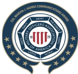
5-star Harris Communications Award Winner